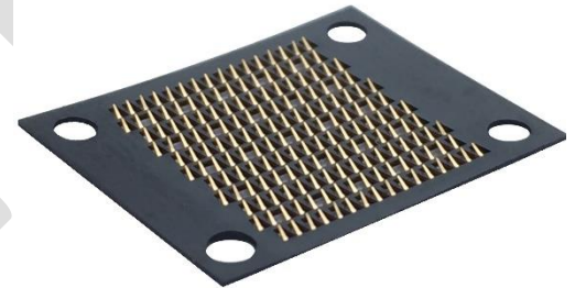
Example: 176 Position